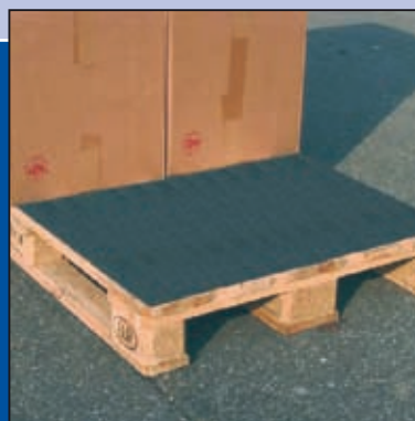
Transport of heavy loads